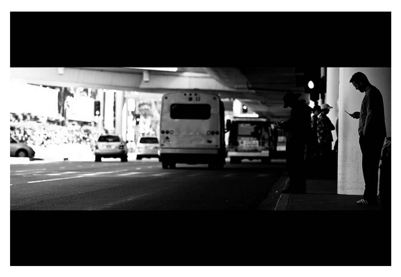
Los Angeles Mayor Eric Garcetti advocates for a wired, interconnected city

Cities must deploy technology that allows for the development of personalized relationships with residents and visitors. Many cities, including Los Angeles, already deploy a mobile app for requesting city services such as pothole repair or graffiti removal with GPS-enabled devices pinpointing the location of the request. The next step? Communicate directly with the people of the city. Residents should receive information about local temporary parking restrictions, power outages, and public safety incidents. Drivers should get notifications about road closures and open parking spaces. Residents and tourists could adjust the app's settings to stay informed about cultural events sponsored by the city. This app could also act as a transaction platform for any city service –from paying trash pickup fees to buying a pony ride at a city park. Bus service, car service, subway access, bike and ride share could all be acquired via this single, streamlined city app. That is the promise of a truly connected city.